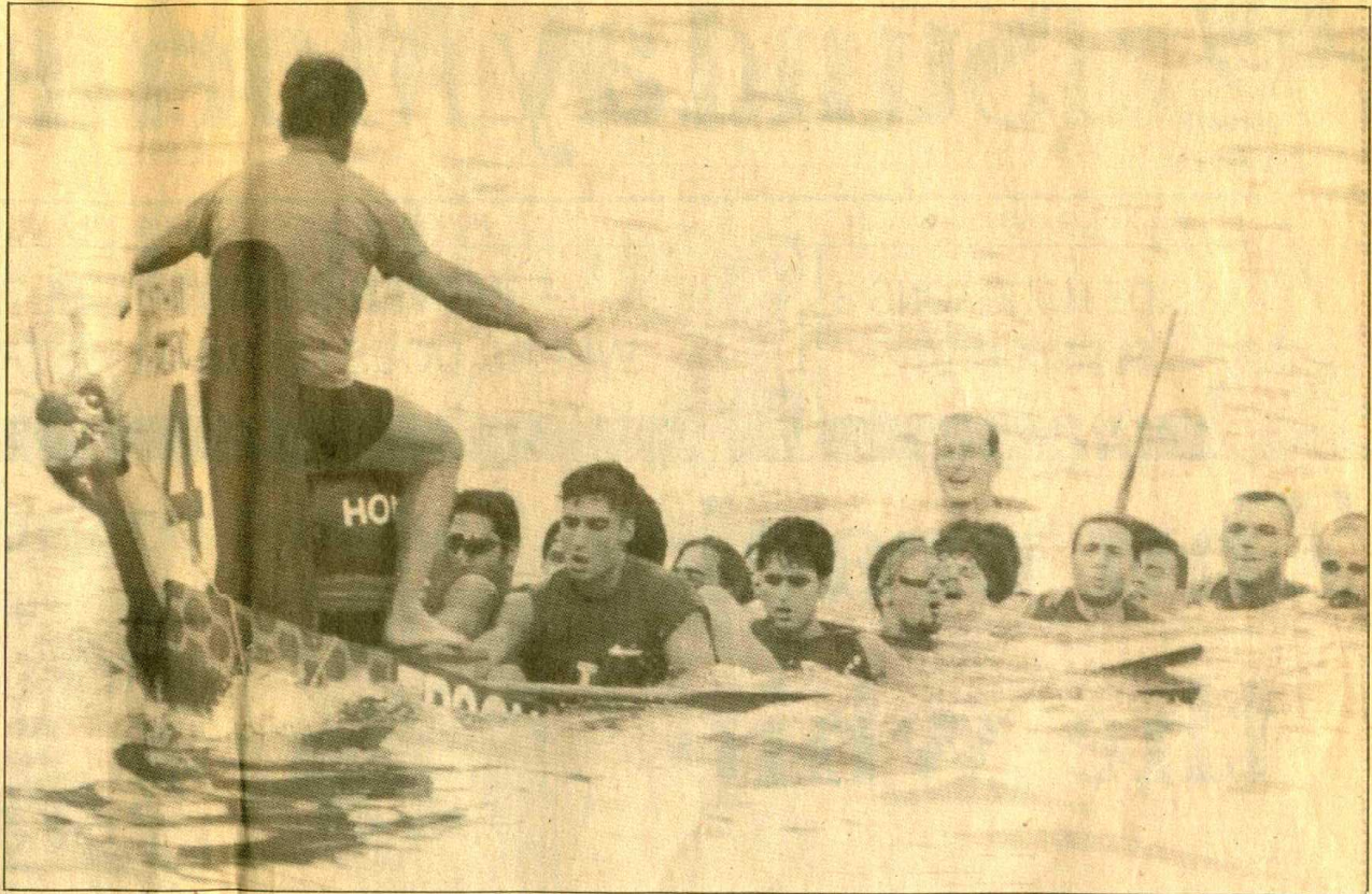
Taking the plunge: members of Italy's Assodragon Italia team take an unexpected dip in the murky waters of Tsim Sha Tsui East yesterday.